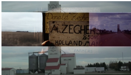
still from Holland, Man.